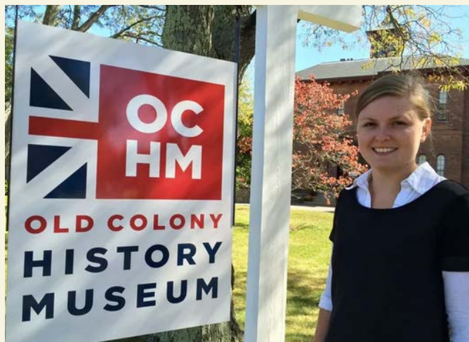
THE NEW OLD COLONY: Taunton's history museum gets a reboot. Published October 2015