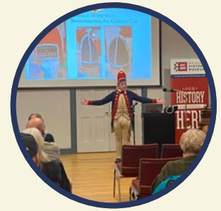
$35,000 Exhibits & Experiences