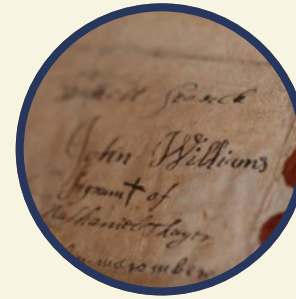
$65,000 Archives & Library